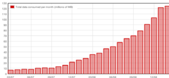
Total data consumed per month (millions of MB)